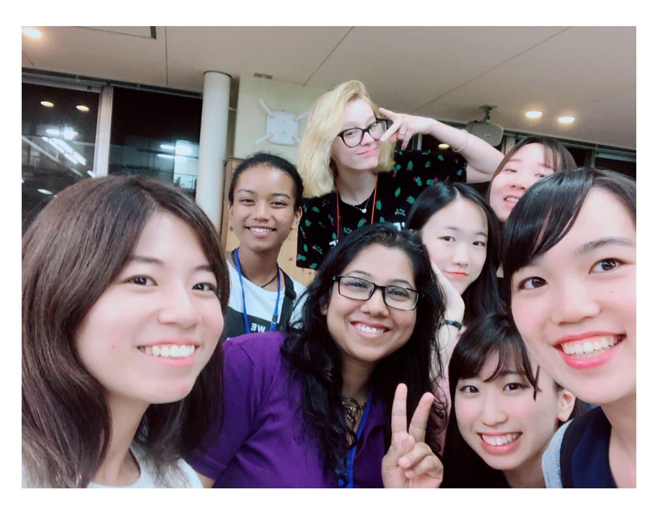
Project groups with various nationalities in a group