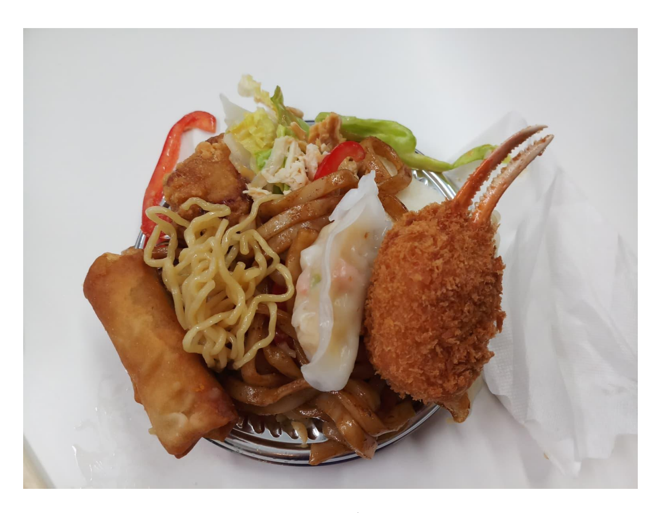
Food at the cafeteria!