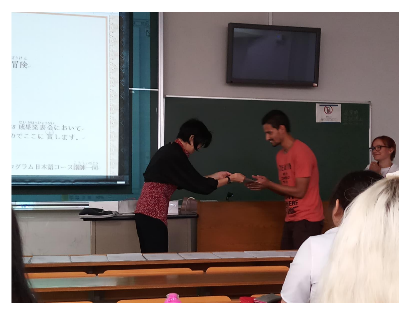
AIT students receive awards for presentation