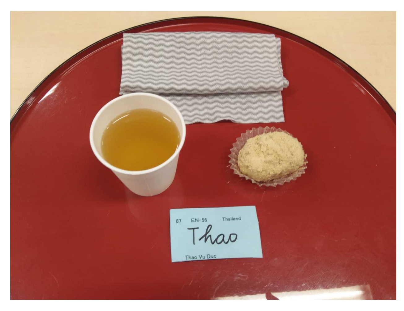
Mochi and green tea at the Japanese food program