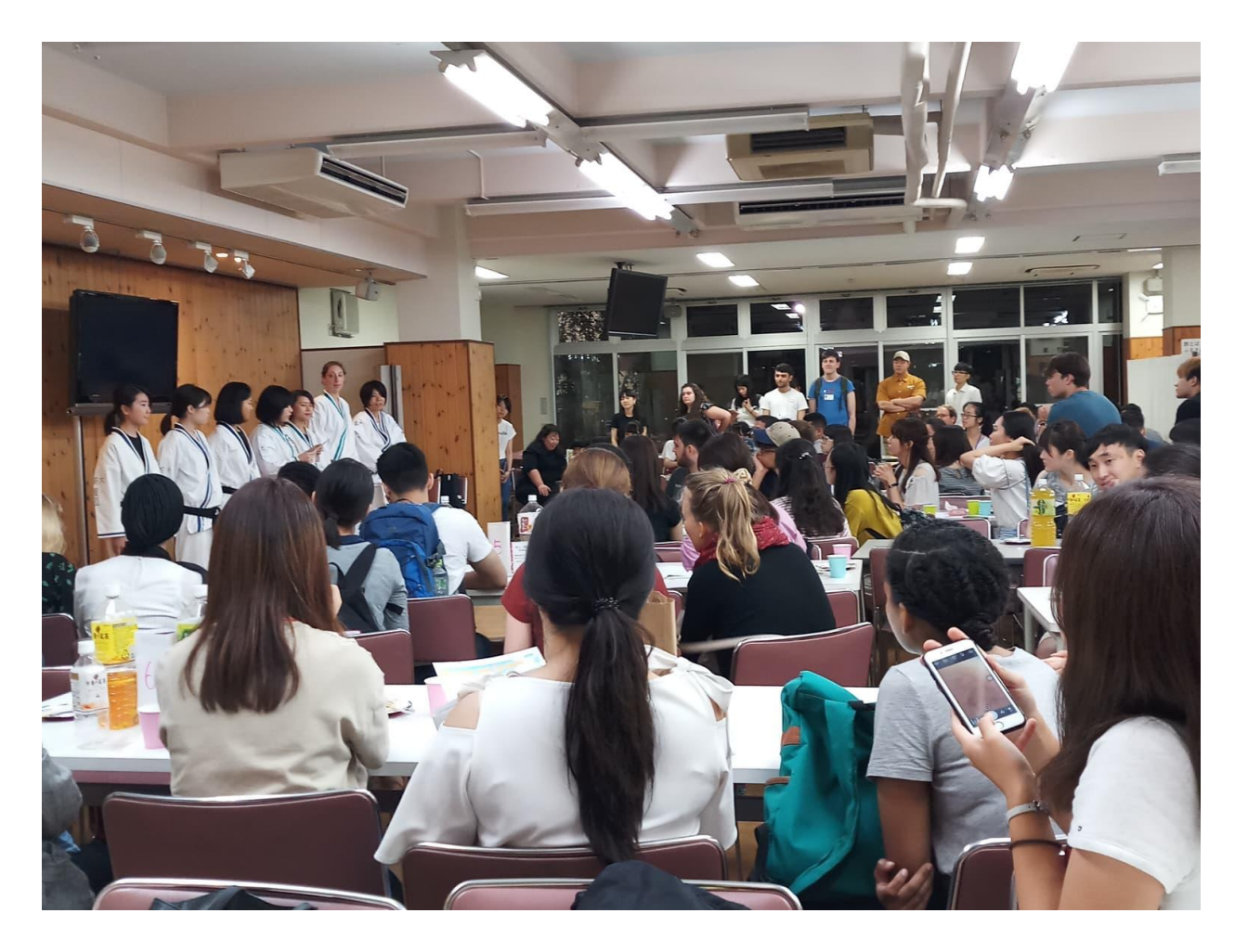
Welcome party with Karate demonstration by ochanomizu students