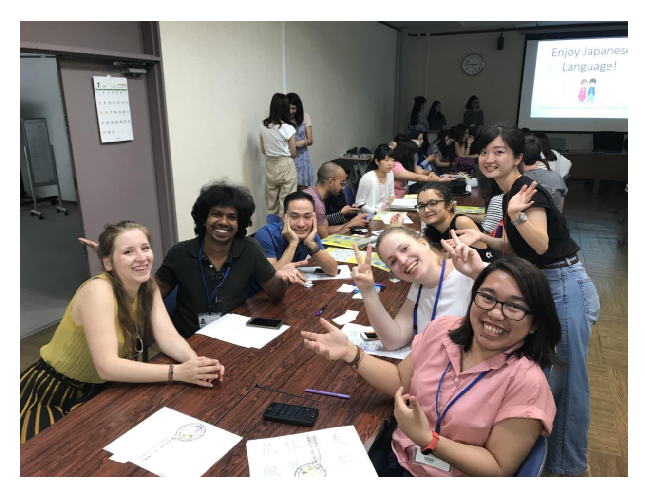
Japanese language class!