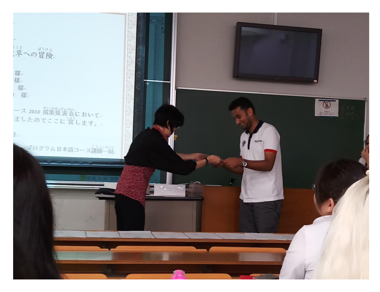
AIT Students receive awards for best group work