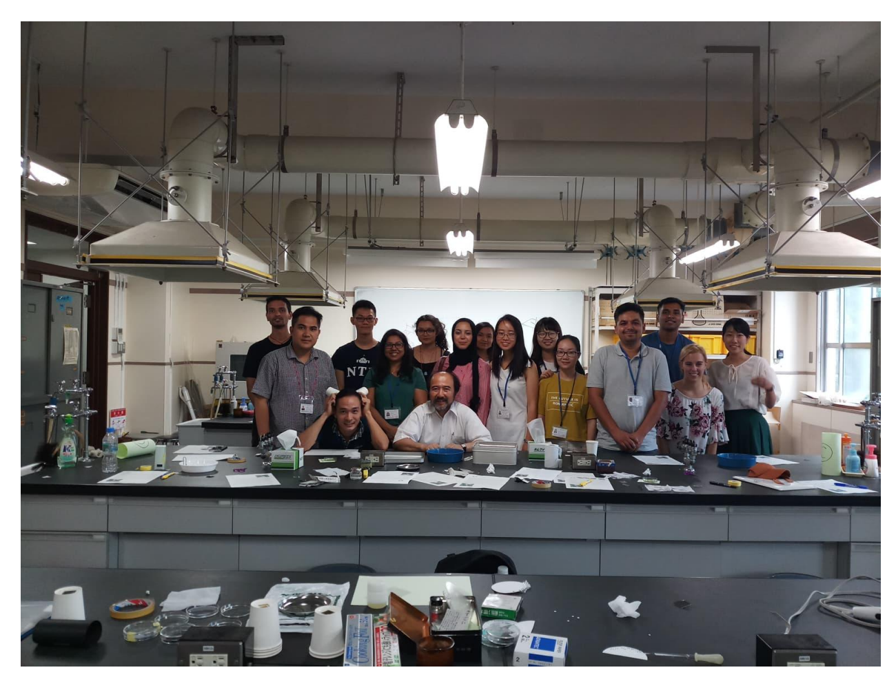
Class photo of science experiments group