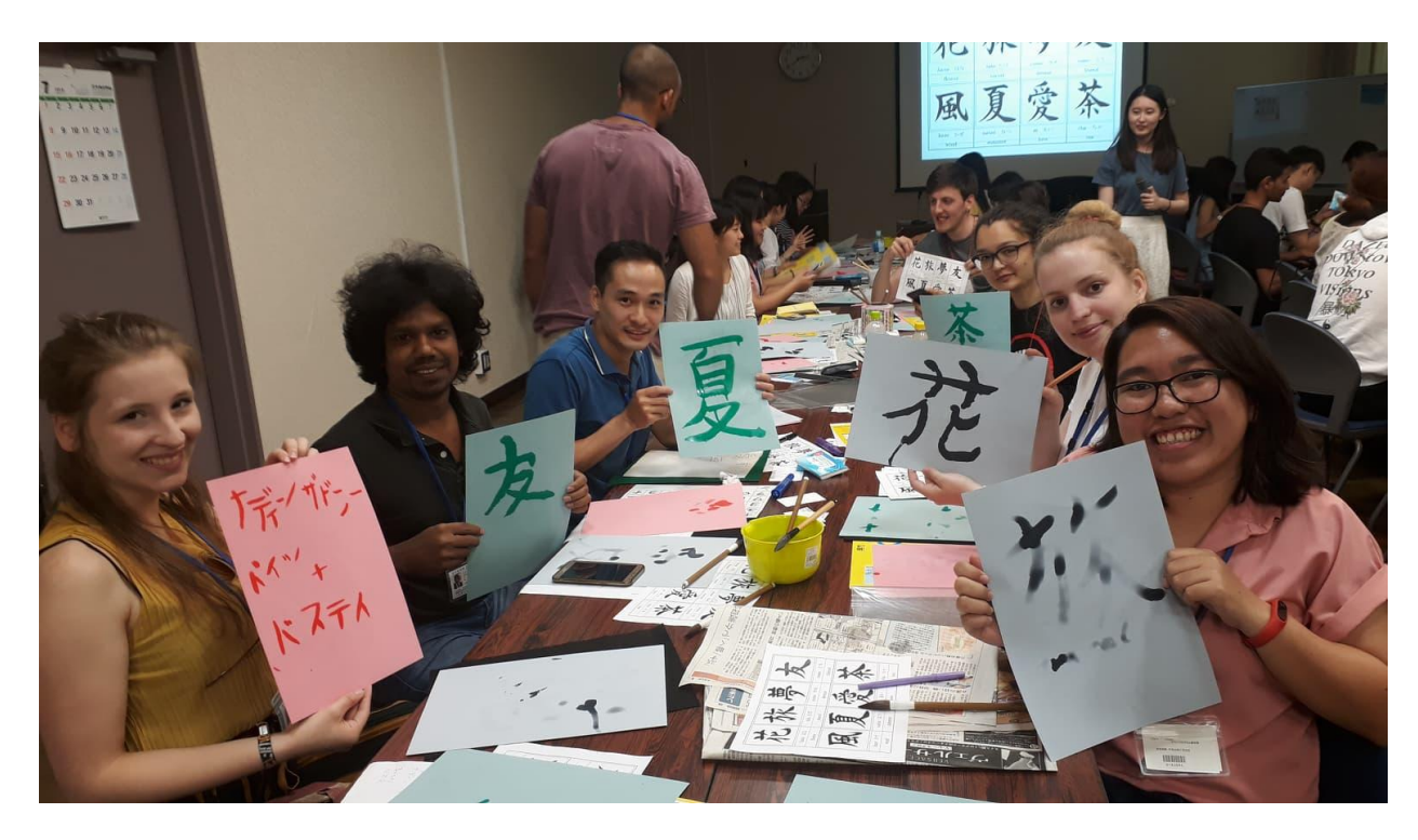
Japanese writing class