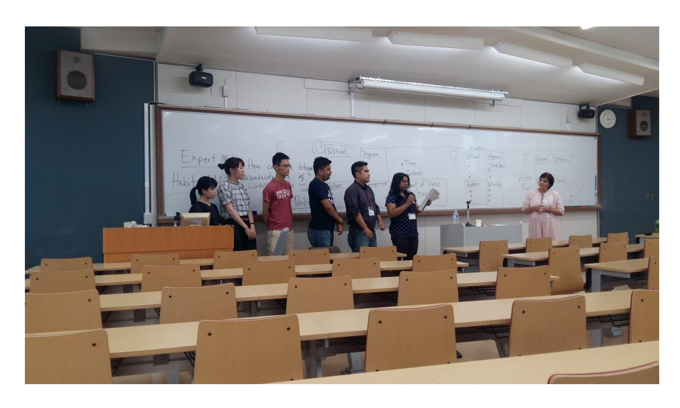
Group Presentation during open lecture on leadership