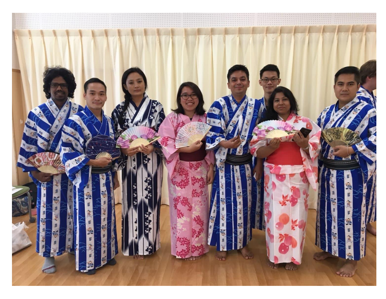
Enjoy Japanese kimono