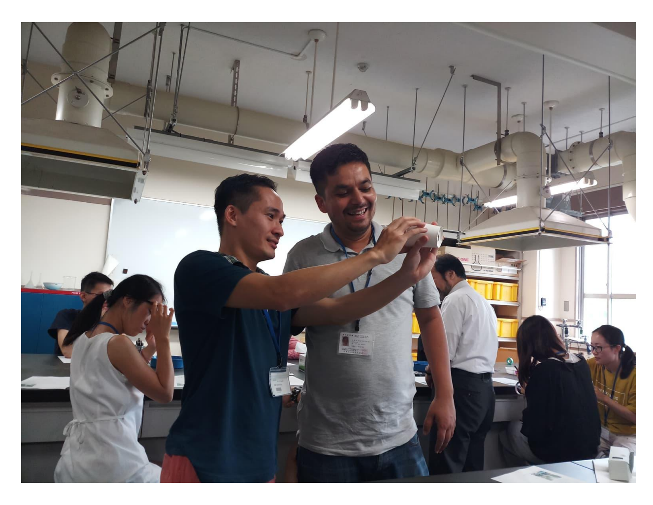
Fun with science, experiment demonstration