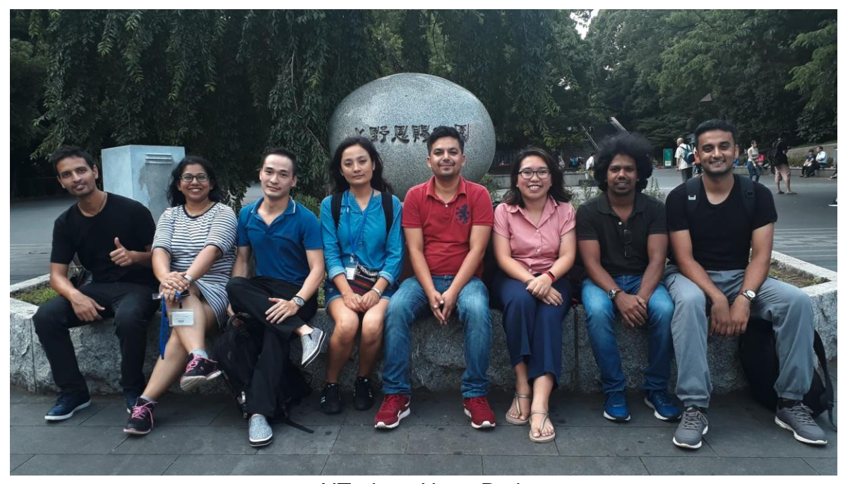
AIT trip to Ueno Park