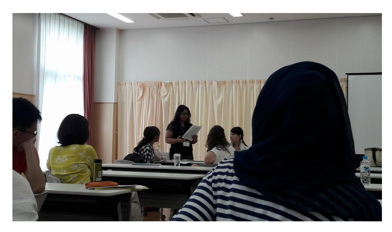
Presentation in class