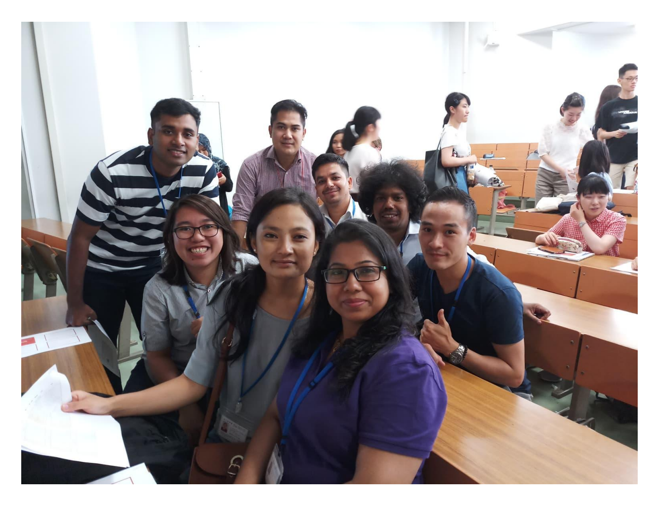
Orientation program at Ochanomizu university