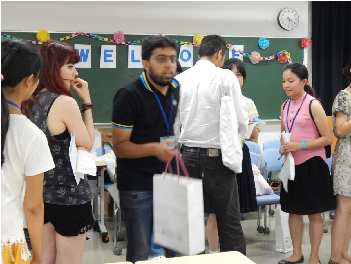
Day 2 (Tokyo Trip):